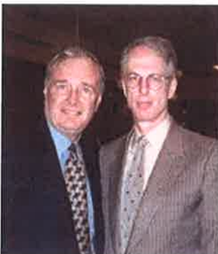
LEFT: Rt. Hon. Paul Martin Jr., Prime Minister of Canada